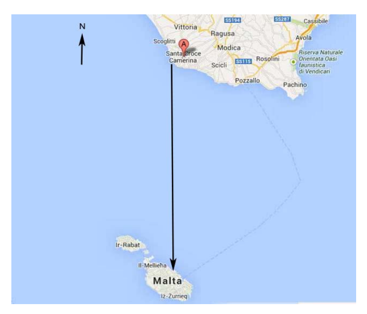
Fig. 2. Possible sailing direction from Sicily to Malta.

Figure 2 shows that, by sailing due south (azimuth 180°) from Santa Croce on the southeast shore of Sicily, the sea vessel will inevitably hit the Maltese Archipelago. Current, wind and weather conditions off the Sicilian Channel may have created considerable difficulty in keeping a small boat which was either rowed or sailed on a steady course.<sup>69</sup> During the day, to find the cardinal direction of south, the sun at midday may have given the sailors an indication. 70 Mental maps of a sequence of memorised images or a chain of events could be recollected; to be orientated within an external coordinate, it is necessary to create a logical form of spatial knowledge so that perceptual information and images can be matched with it.<sup>71</sup> In the case of navigation this includes not only knowledge of landscape and seascape, currents, prevailing winds and wave formations, but also of lunar cycles, star courses and navigational lore to enable speed, drift and heading to be reckoned. As Farr concludes 'It is no wonder therefore that seafaring has been described as a specialist occupation'. 72