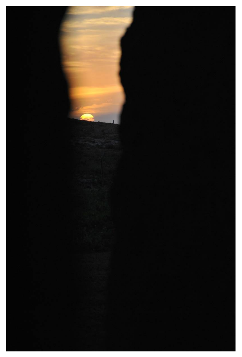
Fig. 3. Above the winter solstice sunrise over the posthole seen from inside Mnajdra South Temple.

astronomical alignments towards the rising of the sun at specific times of a solar year, throughout its millennia-spanning construction period. ^{129}