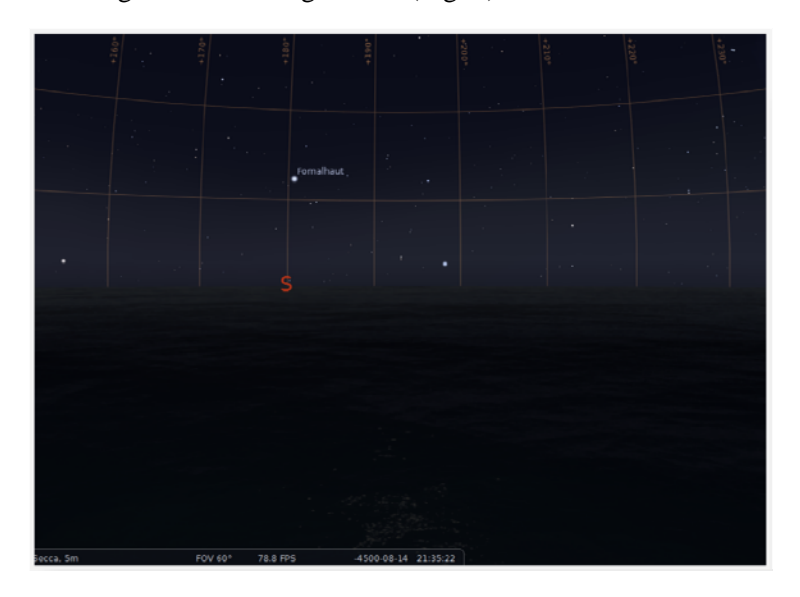
Fig. 1. Sky map seen from Santa Croce on the southeast shore of Sicily looking south on 14 August at 21:35, 4,500 BCE where Fomalhaut is clearly seen at about 180° south. Map, T. Lomsdalen.

Some prehistoric peoples' possible navigational skill sets were mentioned previously. In the case of using astronomy for sea crossings from Sicily to Malta, John Cox suggests the first-magnitude star, Fomalhaut, as an attractive candidate; it passed through south at about midnight in the middle of June in the Temple Period and that the summer may be the height of the sailing season (Fig. 1).<sup>68</sup>