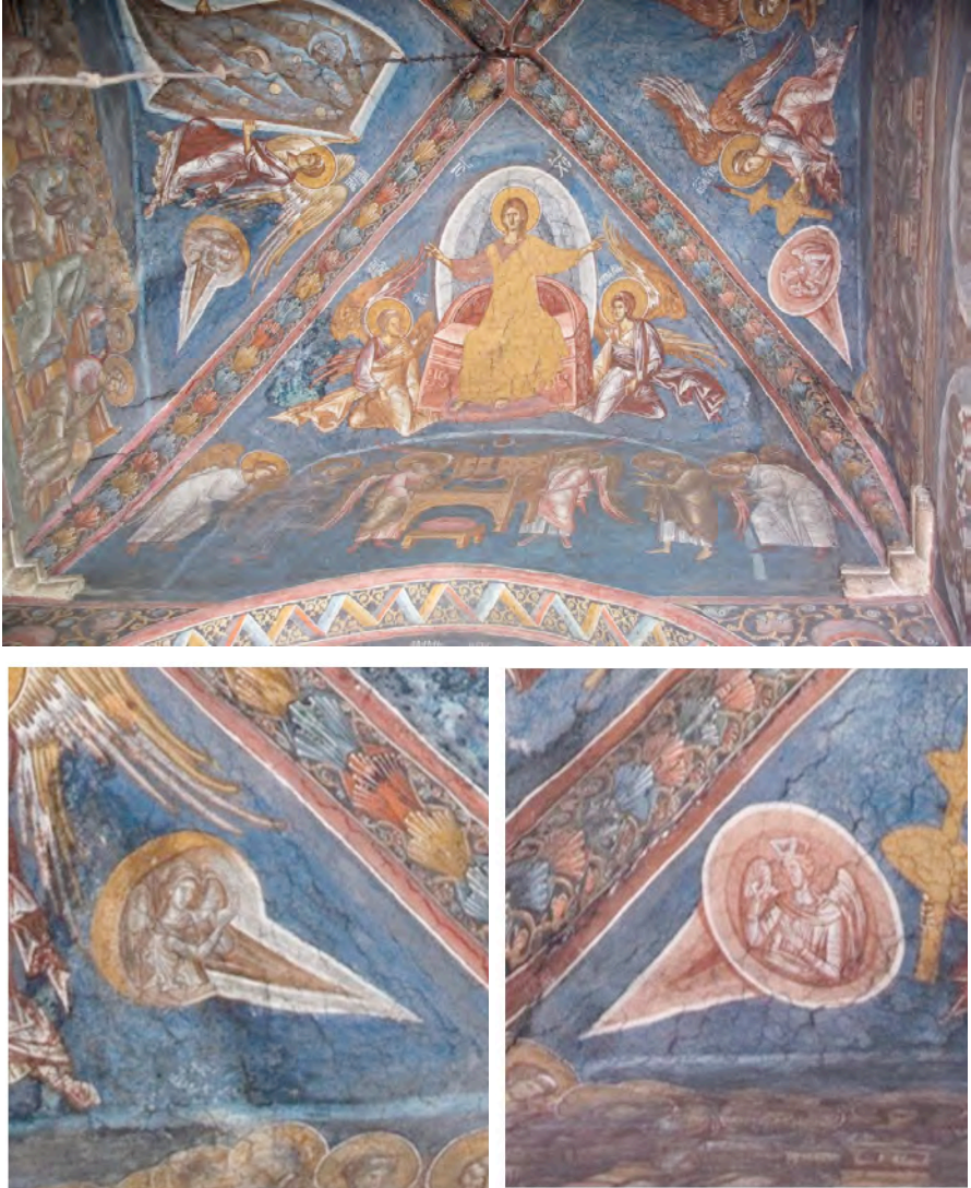
Fig. 3. Above: The paintings of the Sun and the Moon in the central dome of the West bay with The Christ in the Mandorla . Below: enlarged personifications of the Moon (left) and the Sun (right).

The personifications of the Sun and the Moon in both paintings are portrayed as angels wearing fine garments, which is in sharp contrast to the representations of the Sun and the Moon in The Crucifixion fresco, where