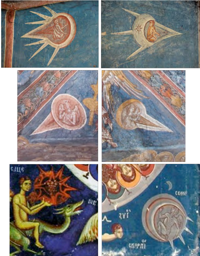
Fig. 5. Left: images of the personified Sun, right: images of the personified Moon; top: from The Crucifixion fresco and in the middle from the West dome of the central nave in Visoki Dečani; bottom: from the Lesnovo monastery.

portrayed in Fig. 5, are located in the central, most important, part of the church. In Fig. 5, on the left side, personifications of the Sun are illustrated – the top image is from The Crucifixion fresco, the image in the middle is from the west dome of the central nave in Visoki Dečani, and the bottom one is from the Lesnovo monastery. On the right side images of the personified Moon are depicted, in the same order.