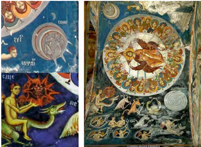
Fig. 4. Right: the zodiac in the South dome of the narthex of the Lesnovo monastery. Left: personification of the Moon (above) and the Sun (below).

The most impressive painting containing cosmological elements in the Lesnovo monastery is the Zodiac, as shown in Fig. 4. On the left side of Fig. 4 there are enlarged images of the personifications of the Moon (above left) and the Sun (below left). 37