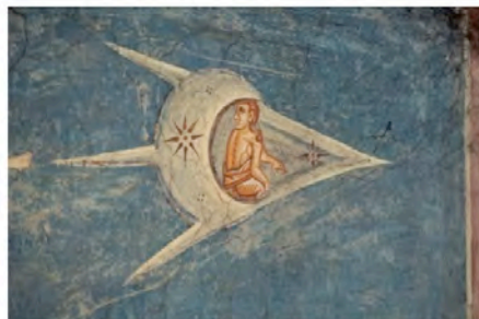
Fig. 2. Above: The Crucifixion of Christ fresco. Below: enlarged images of the personifications of the Sun (left) and the Moon (right).