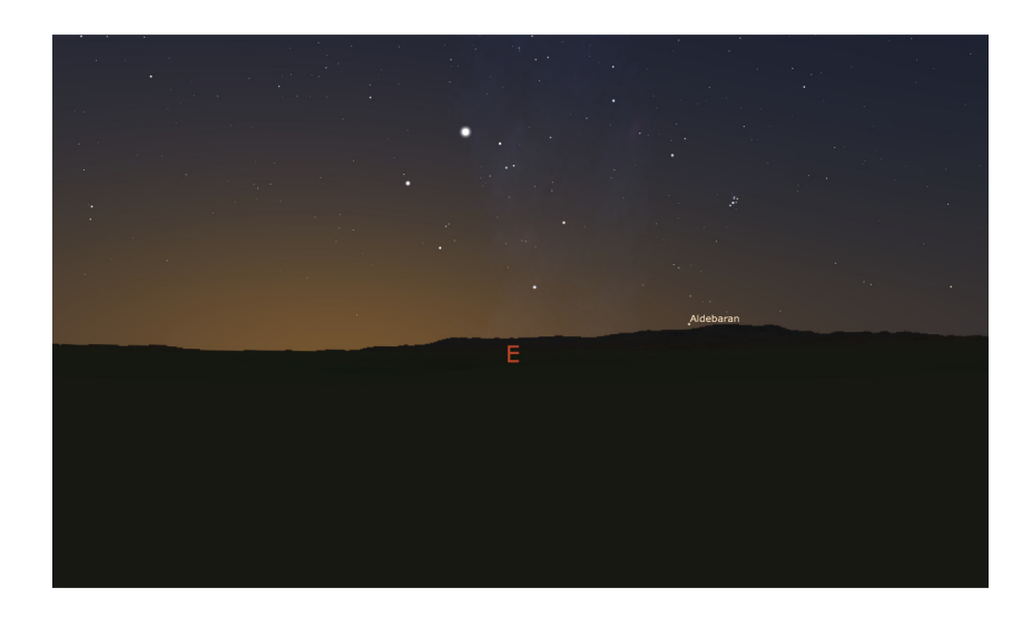
Figure 3 – The view towards the east at dawn at the end of April around 4,000 BCE, as reconstructed using a Digital Elevation Model and Stellarium. Aldebaran, the last star to rise before the sun, is seen to rise directly above Serra da Estrela .

and the fourteenth brightest star in the night sky, would have risen during the period of megalithic construction (see figure 3).