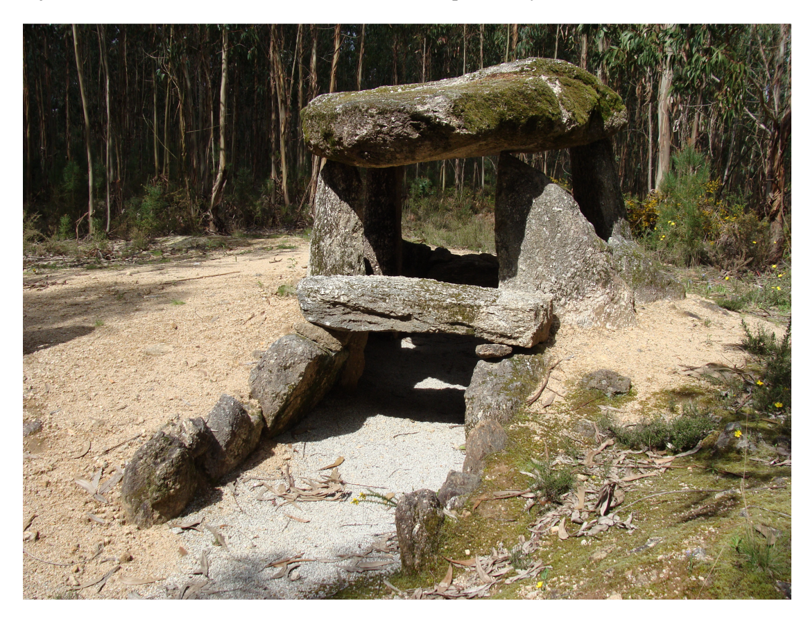
Figure 1 – Orca de Santo Tisco, one of the passage graves in the Mondego basin.

exclusively in NW Iberia, of forecourts outside the entrance, where objects of a ritual nature have been found.<sup>31</sup> Another peculiarity of the