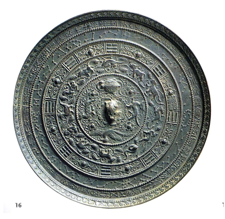
Fig. 5. Mirror with Cosmological Designs. China, Tang dynasty (618–906). Bronze; diameter 26.4 cm. American Museum of Natural History, New York, Berthold Laufer Collection (70/11671).

Within East Asia the exhibition will focus on the ancient Daoist cosmology of China, centring on belief in the Dao as an empty void, beyond time and space, beyond the ability of words to describe, that spontaneously generates the cosmos and the forces of yin and yang that regulate both celestial and terrestrial processes. The beautifully cast back of Tang dynasty (ninth century) bronze mirror in the American Museum of Natural History, New York, is a good illustration of the Chinese Daoist view of the universe's corresponding levels (Fig. 5).