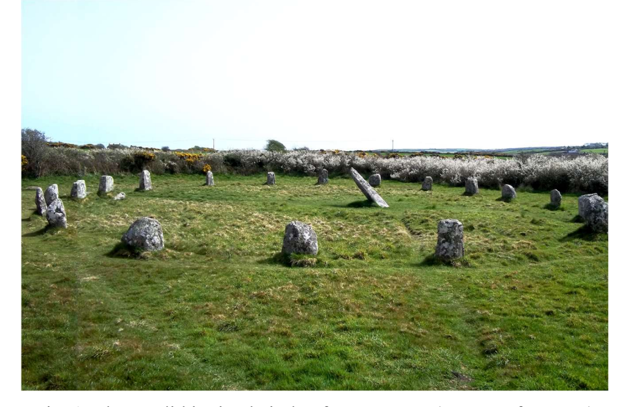
Fig. 1. The Neolithic ritual circle of Dons Meyn ('Dance of Stones') at Boscawen-ûn in Cornwall, England, c. 2500–1500 BCE, aligned with both the summer and winter solstices.

While the exhibition will focus primarily on works of cosmological art from polytheistic cultures (e.g., Mesoamerica, Mesopotamia, Egypt, Greece, Rome, India, and China, to name a few), which have had the largest numbers of celestial deities, both male and female, it will also include artworks from monotheistic cultures in which the creation of the universe is credited to a single deity. In most early cultures the creation is credited to a deity (or deities), but there have also been cultures in which the universe is believed to have been spontaneously 'self-born', without any deity's agency; this is true, for example, in the Chinese Daoist (Taoist) tradition. Cosmologies will explore the deification of cosmic and celestial entities, the visualization of planets, stars, and constellations as homes and embodiments of male and female deities (e.g., the Egyptian deity Isis as embodied by the star Sirius, Osiris by the constellation Orion, and the skygoddess Nut by the span of the Milky Way from Gemini to Cygnus, often depicted on the inner lids of sarcophagi and the ceilings of tombs), the correlation of ancient calendars with asterisms and celestial events, and concepts of time and space and how these were depicted in works of art and sacred diagrams. The exhibition will also explore the links between cosmogonic and celestial deities and terrestrial rulers' political power. Isis