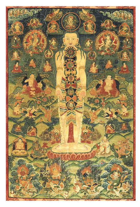
Fig. 4. Cosmic Man with Diagrams of Newar Yogic Six Chakra Transformation. Central Tibet, c. nineteenth century. Thangka; mineral pigments and gold on cotton cloth, 175.26 x 104.1 cm. Los Angeles County Museum of Art, Gift of Dr Mark and Dorothy Stern (M.91.118).

A key theme explored throughout the exhibition is the tension between order and chaos. It was a primary function of many deities to create order out of an inherently chaotic universe. In Vaishnavite Hinduism this is expressed in image of the god Vishnu flying on the back a mythical bird, the garuda , whose talons clutch snakes. The snakes represent chaos, here controlled by Vishnu and his avian mount. At the same time, it is noteworthy that neither Vishnu nor the garuda kill the snakes; instead, the snakes are perpetually subservient to Vishnu – thus chaos is controlled without being entirely eliminated. World religions are replete with these types of narratives. Many elements of the Hindu vision of the universe's structure were adopted by Buddhism. Two remarkable symbolic maps of the cosmos appear in two Tibetan Buddhist paintings ( thangkas ): one is an image of Mount Sumeru, the cosmic axis mundi incorporating both the world of form and the world of formlessness; the other an image of the inner human body as a reflection of the cosmos (Fig. 4).