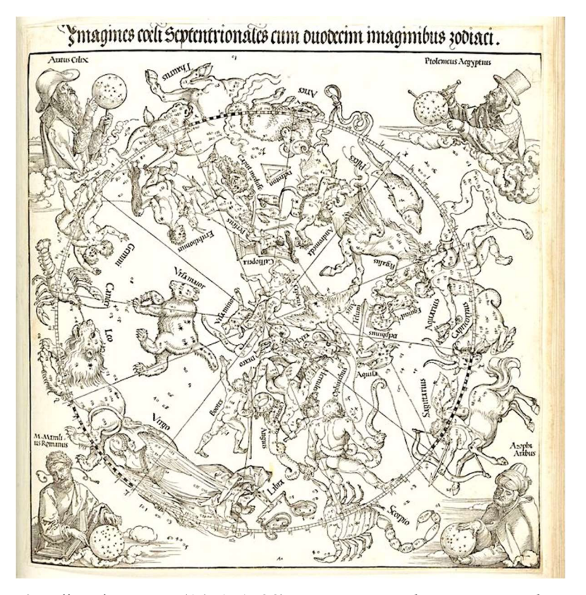
Fig. 3. Albrecht Dürer (1471–1528), Imagines coeli septentrionales cum duodecim imaginibus zodiaci , 1515. Etching; 48.4 x 44.1 cm. National Maritime Museum, Greenwich, England.

The impact of the Islamic astronomers' works is beautifully symbolized by the inclusion in Albrecht Dürer's 1515 woodcut-printed map of the constellations of the northern celestial hemisphere (Fig. 3), from the National Maritime Museum, Greenwich, in the four corners of which are imaginary portraits of the authorities on whom the map is based: Aratus Cilix (Aratus of Soli), Ptolemaeus Aegyptus (Ptolemy), M. Mamlius Romanus (Marcus Manilius), and, notably, Azophi Arabus (the Persian astronomer al-Sufi).