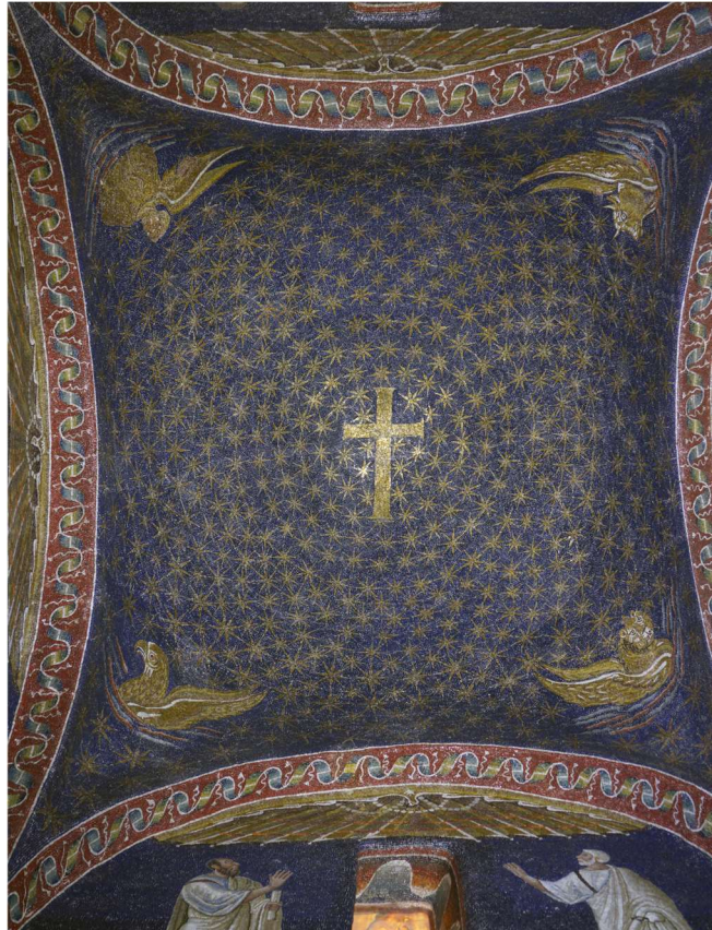
Fig. 1. Mausoleum of Galla Placidia , Ravenna, dome interior, c. 425.

In later Byzantine churches, images of the starry heavens are widespread. Stars feature prominently in many images of God creating the universe, such as the Italo-Byzantine mosaics at the Cathedral of the Assumption, Monreale, Sicily, God Creating the Universe , 1180s. In manuscripts, also, stars are ubiquitous. Hildegard of Bingen's Six Days of Creation from Scivias (twelfth century) and the St Sever Apocalypse, 1028-72, are two such examples. 20 Whilst manuscripts were produced for limited audiences