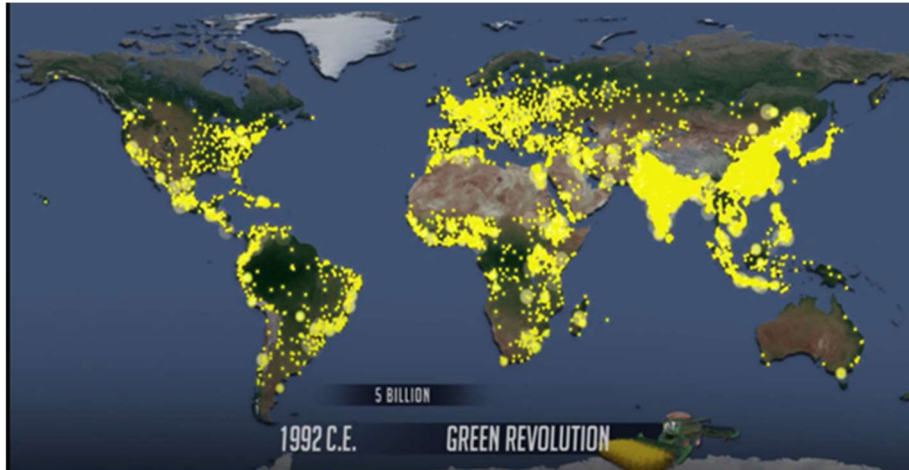
Fig. 6. World population late 20th century (1992), from Population Education - https://vimeo.com/130468614 .