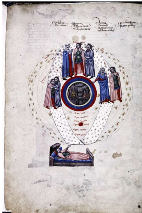
Fig. 4. Cicero's dream of meeting his ancestors in the Milky Way, Macrobius, Commentary on the Dream of Scipio , Bologna c.1383, Lat. 256, fol. Iv (Oxford, Bodleian Library).

The fourteenth-century Breviary by Matfré Ermengau of Béziers (Breviari d'Amour Spain, Catalonia) suggests movement as well, since the stars rotate by the actions of angels, turning crank-handles (like those on an early automobile). Other examples refer back to the Classical Roman tradition. The Milky Way is effectively shown in Macrobius's Commentary on Cicero's Dream of Scipio in the manuscript from Bologna c 1383, now in the Bodleian (Figure 4). 24