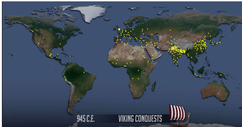
Fig. 2. World population tenth century (945), from Population Education - https://vimeo.com/130468614 .

such as monks, nuns, or wealthy patrons, larger scale mosaics and frescoes in cathedrals and churches would have been more accessible and well-known. The limited population, and hence lighting at the time (as shown on the population map for the tenth century, Fig. 2) clearly rendered such starry landscapes well-known and familiar.