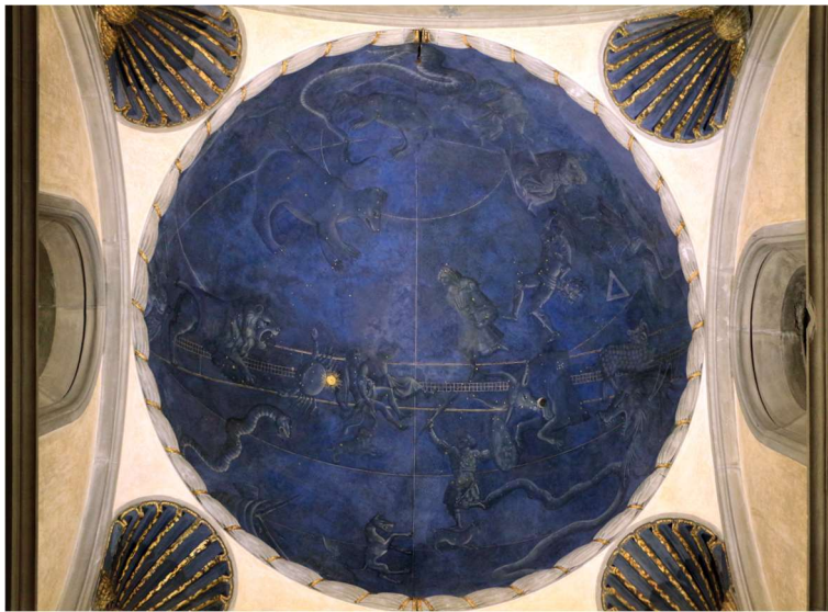
Fig. 5. Old Sacristy San Lorenzo, 1442.

In Renaissance Italy, also, the tradition of depicting the starry night sky continued as in the dome of the Old Sacristy, dated to 1439, at S Lorenzo, Florence, showing the constellations in the astrologically significant dome (Fig. 5).