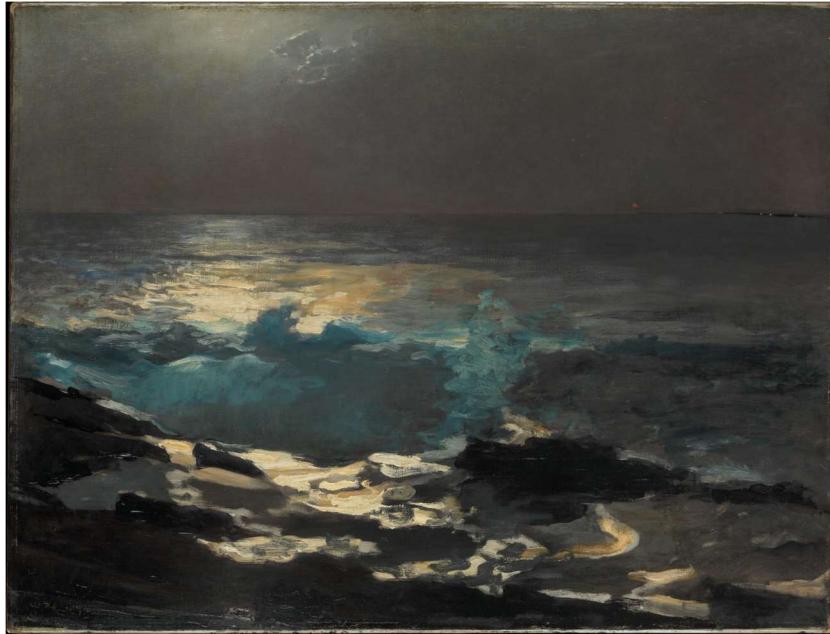
Fig. 2. Winslow Homer, Moonlight, Wood Island Light , 1894, oil on canvas, 30 3/4 x 40 1/4 inches (78.1 x 102.2 cm), Metropolitan Museum of Art, NY, Gift of George A. Hearn, in memory of Arthur Hoppock Hearn, 1911, Accession Number 11.116.2.

Time, Order, and the Night Sky in a Later Nineteenth Century Painting