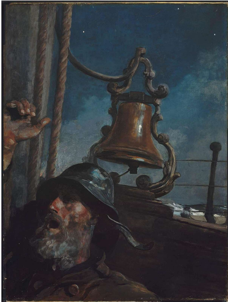
Fig. 1. Winslow Homer, The Lookout – 'All's Well' , 1896, oil on canvas, 101.28 x 76.52 cm (39 7/8 x 30 1/8 in.), Museum of Fine Arts, Boston, Warren Collection—William Wilkins Warren Fund, Accession Number 99.23.

stage of the foreground action. If this is the case, then our astronomical interpretation is done.