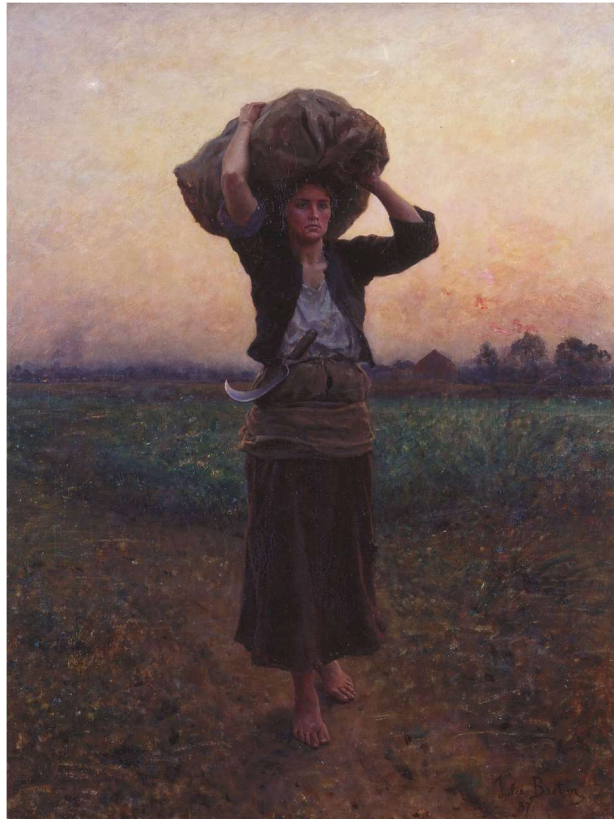
Fig. 3. Jules Breton, The Shepherd's Star , 1887, oil on canvas, 40 1/2 x 31 inches (102.8 x 78.7 cm), Toledo Museum of Art, OH, Gift of

famous 1889 Starry Night and more prosaically in works like Gustave Doré's Mountain Landscape , 1877. 6 The former depicts the natural rhythms of time in a rural or traditional world. The latter is a celebration of the vast energy of natural phenomena and the promise, or peril, of an infinite universe in a dynamic and modern world.