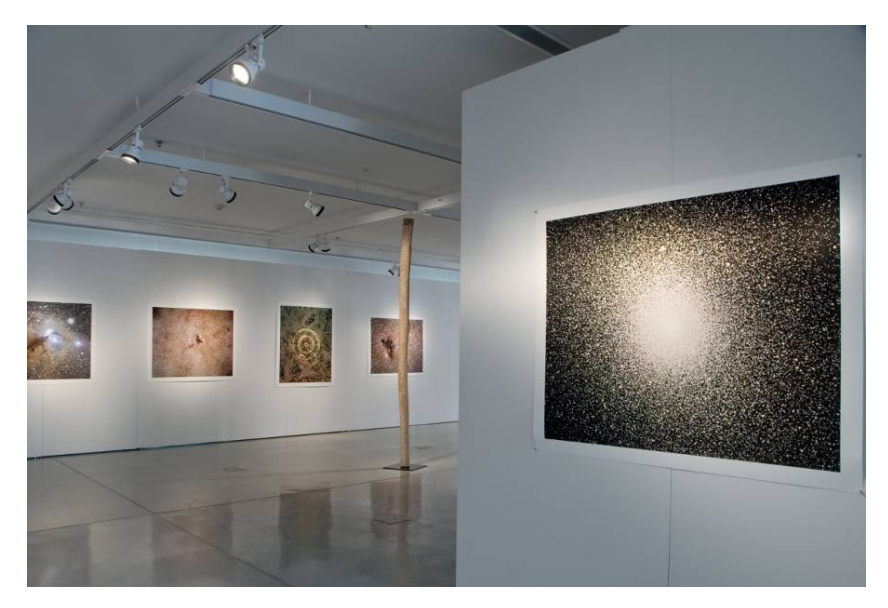
Figure 5. David Malin, uks037a Corona Australis reflection nebula , 2008, pigment inkjet print

David describes the Globular Cluster 47 Tucanae 2007 (aat 076) (Figure 6), as an ancient city of stars, a faded remnant of energetic bursts of star formation 15,000 light years distant. In the Clouds of stars and dust in Sagittarius 2008 (uks 020), he points out myriad ancient stars crisscrossed with dusty streaks and dark clouds pricked with star clusters. The Wide field view of Barnard 86 and NGC 6520 2007 (aat 092), is described as being cool, yellow ancient star fields of the southern Milky Way orbiting the inner part of the galaxy, and the clusters of younger, mainly blue stars NG 6520 are found in the spiral arms. A closer view of the region Dust cloud and open cluster NGC 6520 2006 (aat022), reveals the dark Cloud Barnard 86 and the cluster of hotter, bright blue stars. Finally, in the image, the Light echo of supernova 1987A, David has captured a self-destructing star in the large Magellanic Cloud close by our Milky Way galaxy. It exploded in a brilliant flash of light visible to the naked eye. Some light was deflected by two sheets of dust near the star. These light echoes, recorded in a series of six images, (the last being about five years after the appearance of the supernova), appear to expand with time. This light has taken 170,000 light years to reach us and was at its brightest in May 1987.