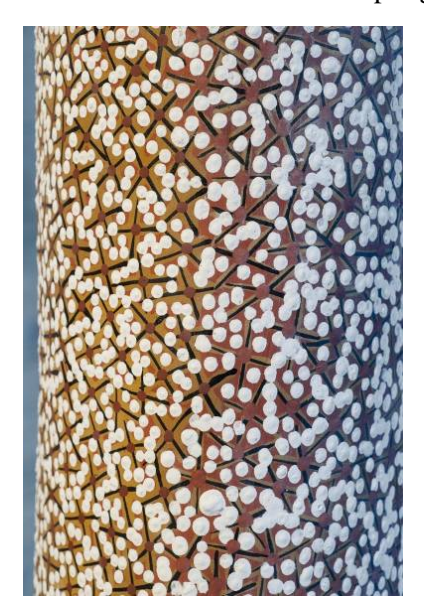
Figure 2. Gulumbu Yunupingu, Garak – the Universe , 2008 (detail), natural pigments on wood

The large stars are those visible to the naked eye, and the dots represent what remains invisible (Figures 2 and 3). Like an x-ray view, these intricately detailed surfaces painted in natural pigments suggest the invisible depths of the Universe and the metaphorical mapping of the cycles and atomistic interconnectedness of all life. Gulumbu's paintings emphasise both the universal and the culturally specific. For Western eyes, they suggest subliminal mathematical relationships that link art to science, metaphysics and epistemology. She speaks in a both humble and philosophic way about the ideas she hopes the viewer will find in her work: 'When you look up, go deeper until you can see the dots in my painting. Look around, keep studying. The mind goes up and up, we don't know where or how deep it goes'.<sup>4</sup>