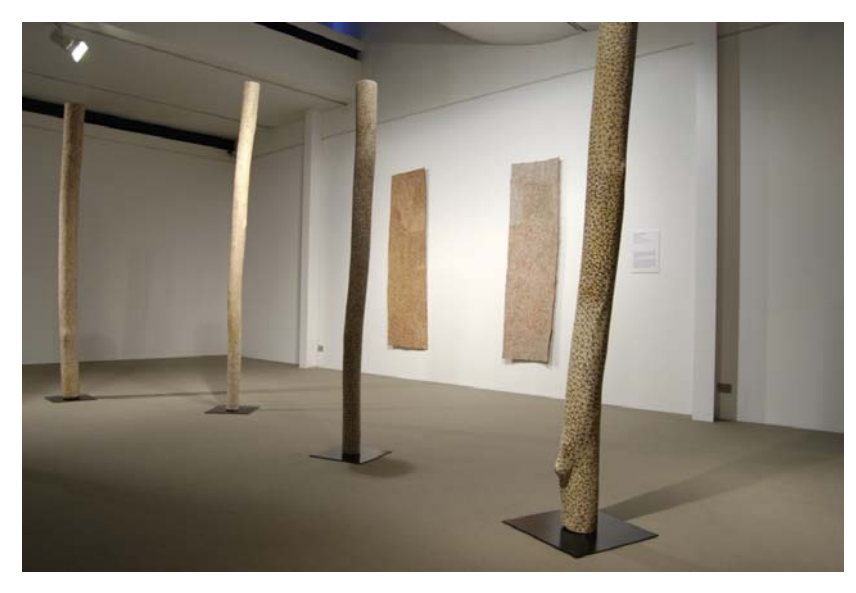
Figure 3. Gulumbu Yunupingu, Garak – the Universe , 2008, natural pigments on bark and wood, Monash Gallery of Art Melbourne

While working as a photographic scientist at the Anglo-Australian Observatory, David Malin developed innovative imaging processes which enabled considerable enhancement of celestial bodies, most of which represent phenomena beyond the human eye. These pioneering analogue photographs captured the first true-colour images of deep space. The human eye is unable to see colours when light levels are low, so light is enhanced through colour to make such phenomena visible. Taken with a prime focus camera mounted in a cage at the Observatory, David explains the process: