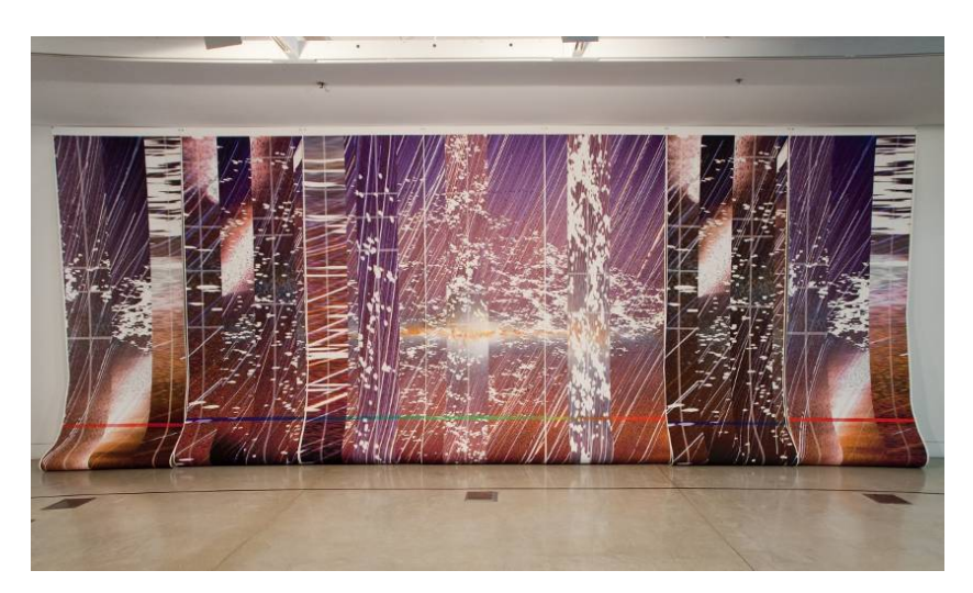
Figure 7. Felicity Spear, Deep Field , 2007, seven pigment inkjet prints, University of Technology Sydney Gallery

down the wall and curve out over the floor and back on themselves at their bases. This creates a wave-like structure suggesting the arc of the sky and the curved nature of space and time as we now understand it.